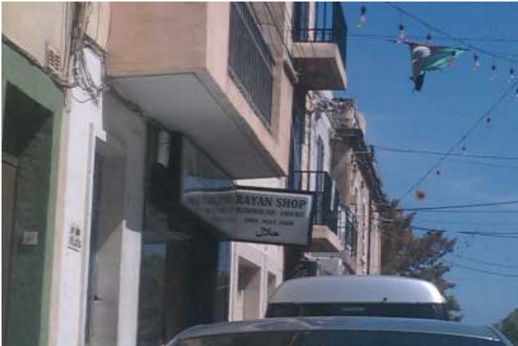
The two Halal food stores pictured on this page face one another on opposite sides of San Gwann's main street. San Gwann is emerging as the main hub of activity for Malta's Arab Muslim population. Also note the Libyan flag hanging in front.