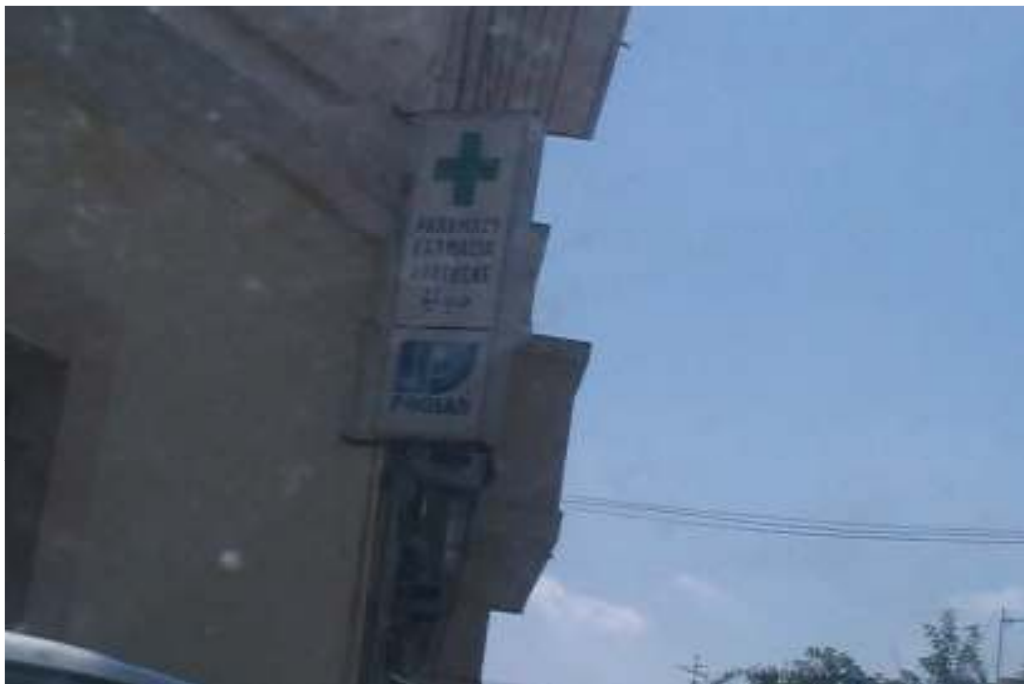
It is now standard for pharmacy signs to use a number of different languages apart from English: in this case German, Italian and Arabic.