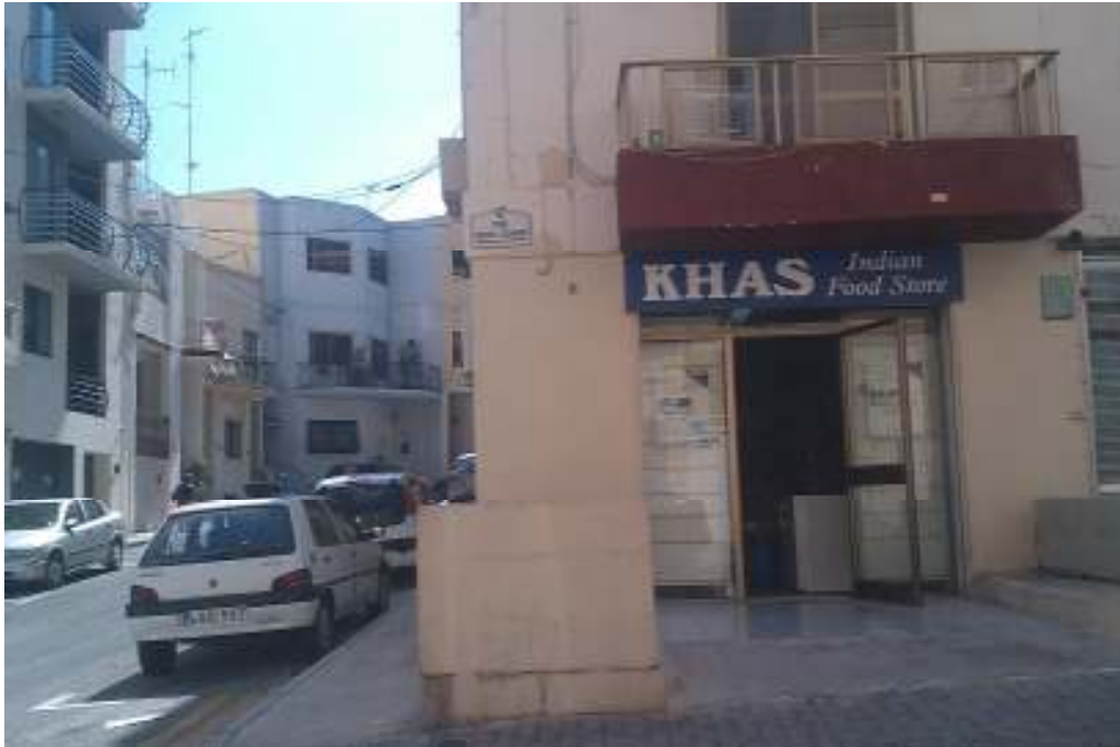
Just down the road from the first store, the Indian food store above testifies to the emergence of the Gzira area as a hub for TCNs.