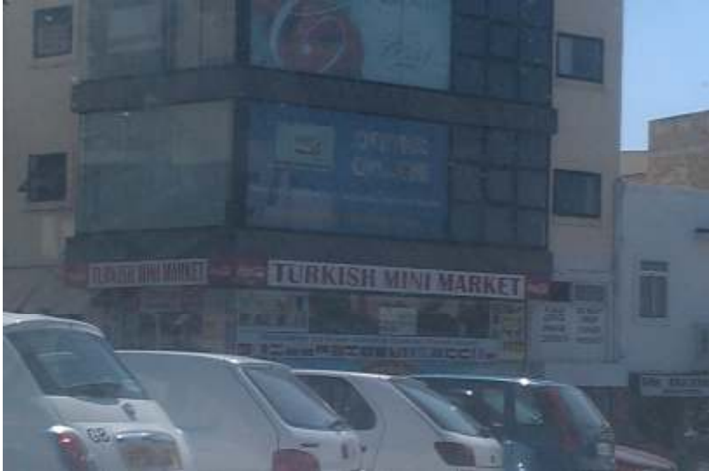
The shop above is conveniently located just opposite the old entrance to University. Its shop-sign (below) makes clear that it caters for all the Balkans and not just Turkey